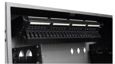
High Density Cable Management