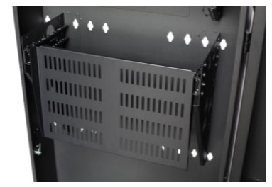
0U Mounting Options