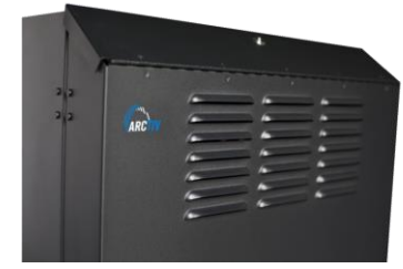
Max Airflow for High-Power Equipment