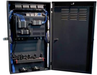
Full Access to Equipment