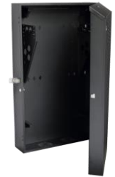
Greater Equipment Mounting Depth and Load Rating