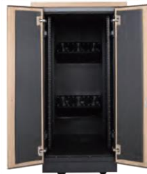
Integrated Sound Foam Provides up to 20dB Noise Reduction