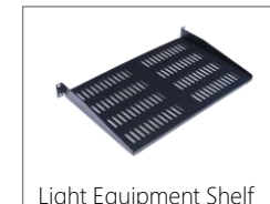
Light Equipment Shelf