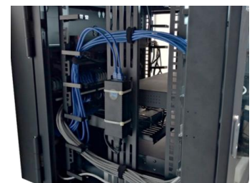
4U Equipment Mounting