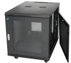
Full Access to Equipment