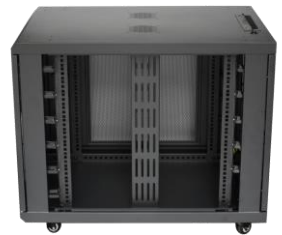
Greater Equipment Mounting Depth and Load Rating