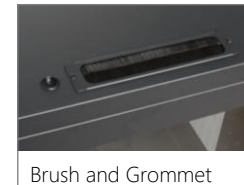
Brush and Grommet