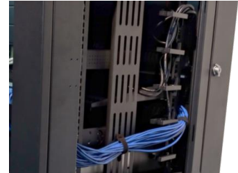
Revi-Ring™ Cable Management