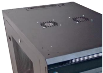
Max Airflow for High-Power Equipment