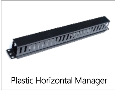
Plastic Horizontal Manager