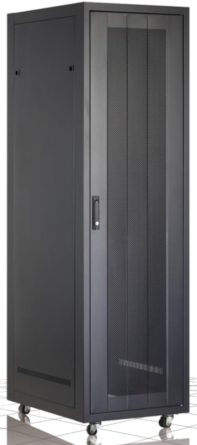
Front View Vented Door

ArcTiv Network Racks are flexible, easy to install and compatible with high-density cable management accessories to provide efficient storage of networking systems in on-premise environments. Each network rack supports: