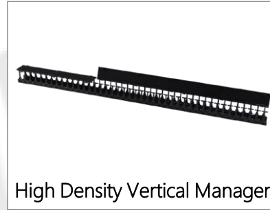
High Density Vertical Manager