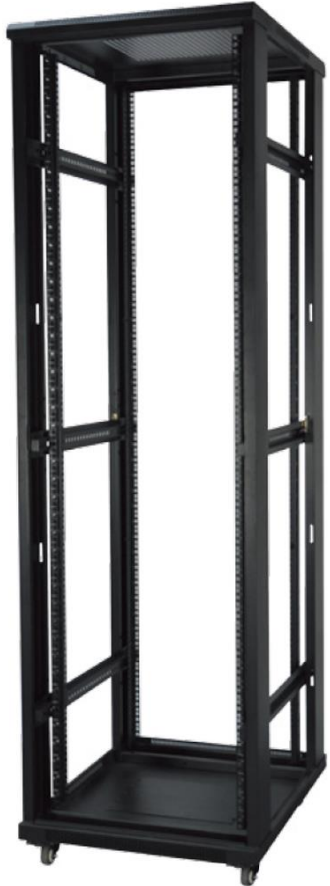
Frame View Bolted Frame