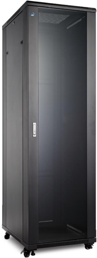
Front View Glass Door