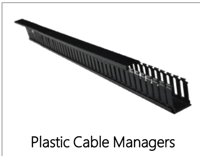
Plastic Cable Managers