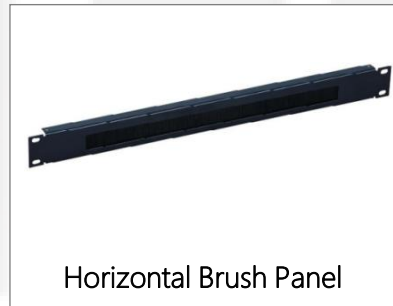
Horizontal Brush Panel