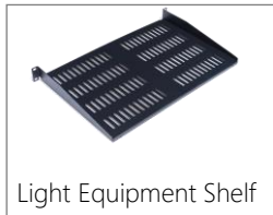
Light Equipment Shelf