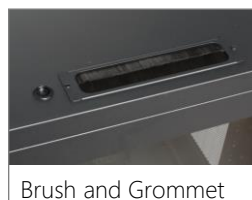
Brush and Grommet