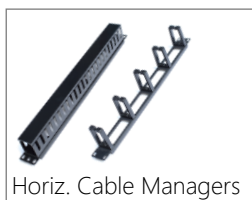
Horiz. Cable Managers