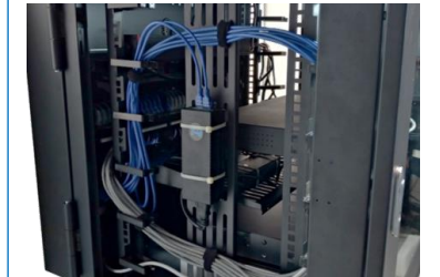
0U Equipment Mounting