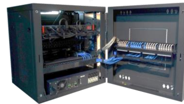
360° Access to Equipment