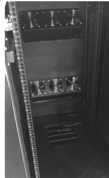
Max Load Rating and Fan Capacity