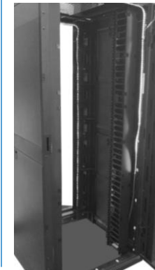
Vertical Cable Managers