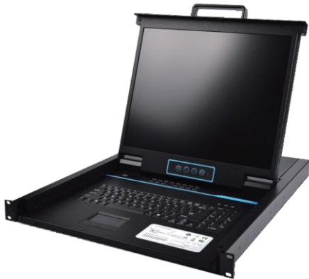
Front View IP-Based KVM