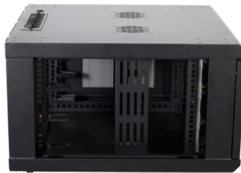
Larger Depth and Load Rating