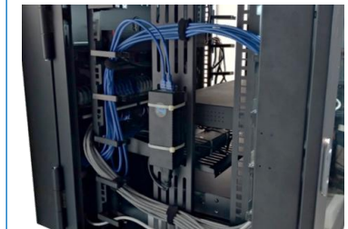
0U Equipment Mounting