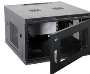
Locking Door and Side Panels