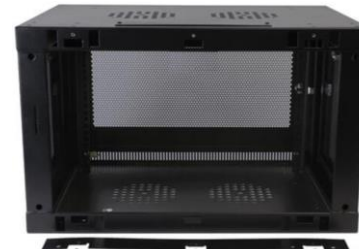
Secure Wall Mounting