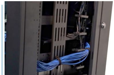
Revi-Ring™ Cable Management