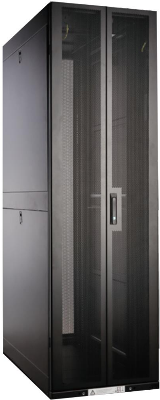
Rear View High-Perforation (86%) Split Rear Doors