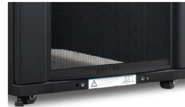
Heavy Duty Castors Rolling Capacity 1050kg