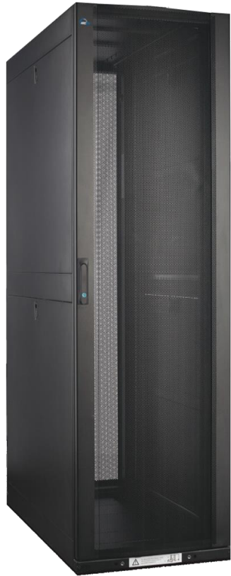
Front View High-Perforation Door (86%)