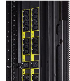
0U PDU Mounting Rear-Mount Vertical PDU's