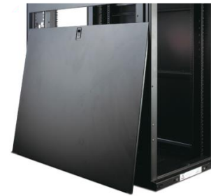
Split Side Panels Easy, Light-Weight Removal