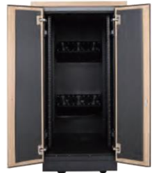
Integrated Sound Foam Provides up to 20dB Noise Reduction