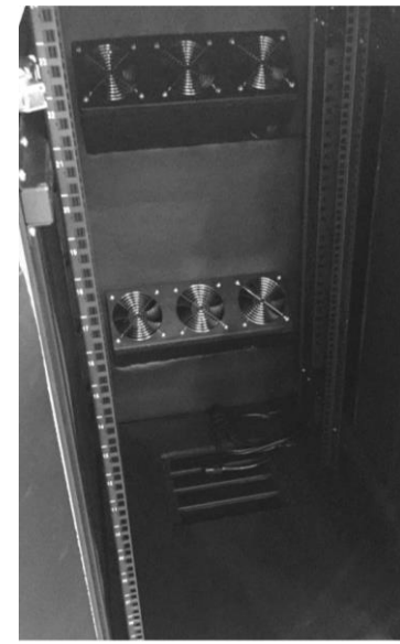
Max Equipment Mounting Depth, Load Rating and Fan Capacity