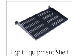
Light Equipment Shelf