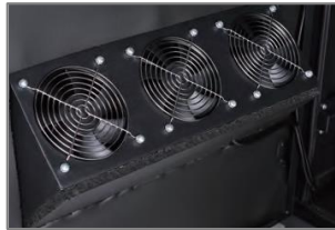
Low-Noise Fan System