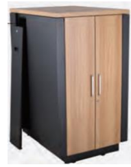
Removable Side Panels for Rear PDU Access