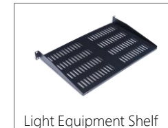
Light Equipment Shelf