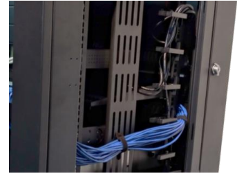
Revi-Ring™ Cable Management