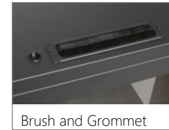
Brush and Grommet