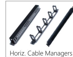
Horiz. Cable Managers