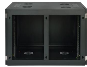
Secure Wall Mounting