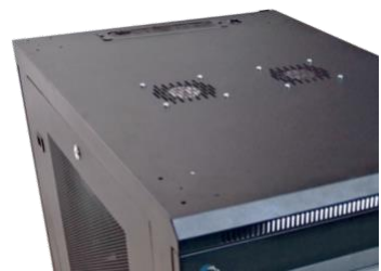
Max Airflow for High-Power Equipment