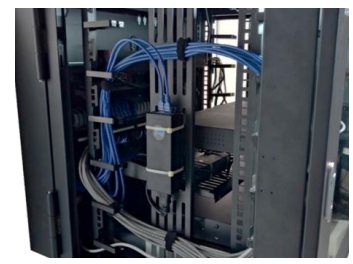
OU Equipment Mounting