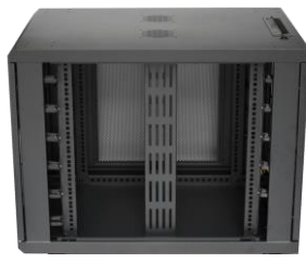
Max Equipment Mounting Depth and Load Rating