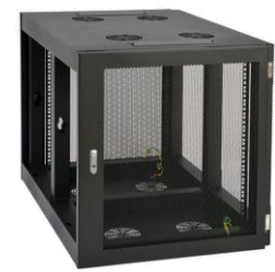
Locking Door and Side Panels